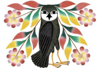
Inuit artist/printmaker Kenojuak Ashevak

“On this month and every month, let us honour our past and embrace the history, knowledge and traditions of our First Nations, Inuit and Métis communities.”, Mary Simon, Governor General of Canada.