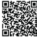
BCCDC test results