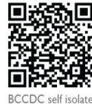
BCCDC self isolate

Please visit the BCCDC website for more information about testing children and youth. Your child will need to self-isolate after their test. This means you should go directly home after their test. Your child should stay home from school and not see visitors. Learn more at the BCCDC website.